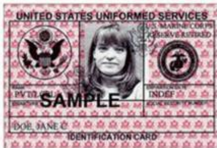
Grey Area Retired